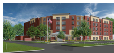
The Montclare at Lawndale

Funding sources for the $27.7 million project include a loan from the U.S. Department of Housing and Urban Development (HUD), Low-Income Housing Tax Credits, City of Chicago HOME Funds, a TIF grant, and an Illinois Department of Commerce and Economic Opportunity Grant.